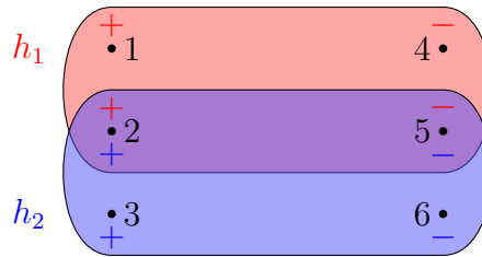
Figure 1: A bipartite hypergraph with V_1 = \{1, 2, 3\} and V_2 = \{4, 5, 6\} .

Definition 2.4. The degree matrix of \Gamma is the n \times n diagonal matrix